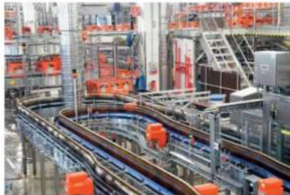
The complex filling system at Erdinger Weißbräu necessitated division of the lubricating system into individual zones

With the LMC 301, SKF has created a cost-effective solution whose modular nature avoids "over-sizing" of the control unit.