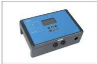
The compact, expandable modular LMC 301 control and monitoring unit with LCD display and six function keys for programming, configuring parameters and signaling

SKF equipped Erdinger's entire filling plant with the system to grease machinery and rolling bearings on conveyor belts. A total of more than 3,000 lubrication points in two halls and a connecting tunnel were connected to the zoned system. This system consists of 90 sections (=zones) and three drum pumps that supply the main lines,