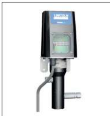
The EDL1 by SKF is an innovative metering and pressure-booster pump that increases an inlet pressure of at least 2 bar to an outlet pressure of up to 280 bar

The lubrication system is supplied by a large drum pump that feeds grease to the main line through to the decentralized EDL1 pump installations. These boost the pressure to up to 280 bar, ensuring that the many locations even in distant points are reliably supplied with lubricant.