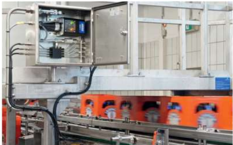
View into a section cabinet with EDL1, progressive feeder and stopcock to the main line

Erdinger and the machinery supplier brought in SKF, which had already been a partner in the installation of a two-circuit system in the past, to implement their project. The zoned system now implemented by SKF is equipped with the new EDL1 (Electric Driven Lubricator) systems, which are electrically driven and easy-to-use pressure-booster pumps capable of generating high outlet pressure from low inlet pressure.